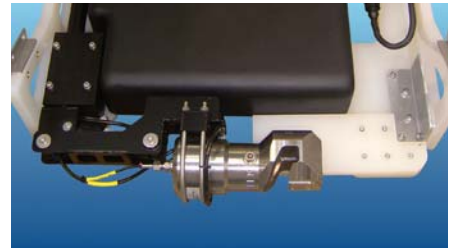
CABLE CUTTER SKID