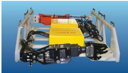
LYNX MANIPULATOR SKID