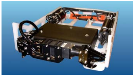
TIGER MANIPULATOR SKID