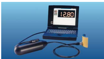
LYNX CYGNUS UT GAUGE