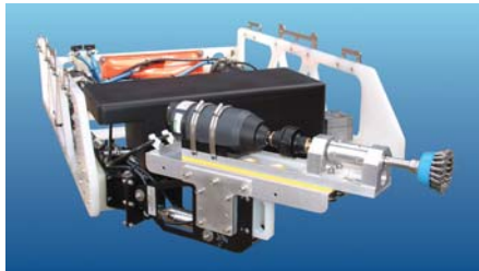
CLEANING BRUSH SKID