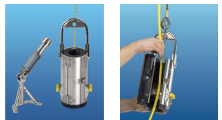
LOCK LATCH FOR FREE-SWIMMING OPTION