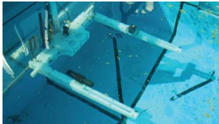
LYNX FMD ORIENTATION TOOL SKID