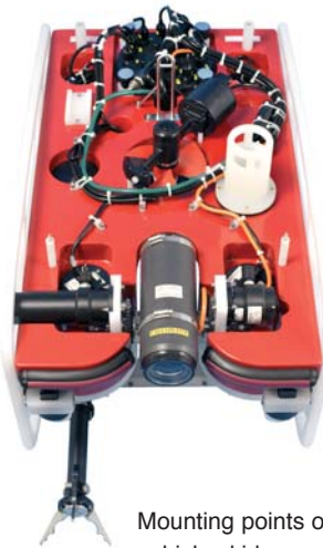
Mounting points on the vehicle skids are provided for lead ballast to trim the vehicle's centre of gravity and buoyancy.

Buoyancy and payload is provided by securing buoyancy blocks of the appropriate depth rating to the chassis below an easily removable hydrodynamic cover. The cover also provides protection to electronics housings and cabling routed along the top of the buoyancy to the junction box. This also provides exceptional ease of access for maintenance.