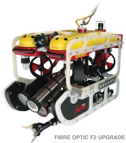
FIBRE OPTIC F2 UPGRADE FOR ADDITIONAL CAPABILITIES

The Seaeye Falcon's open frame construction allows many standard accessories to be easily fitted. Larger tools and sensor packages can be accommodated using a skid fitted under the vehicle with compensating buoyancy where necessary. A selection of items are featured below however many specialist tooling and custom built accessories are also available.