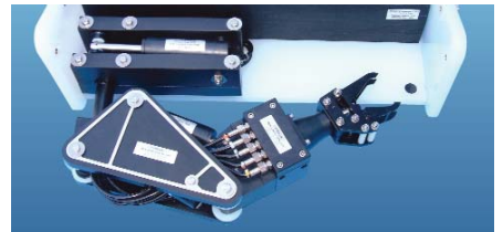
5 FUNCTION MANIPULATOR SKID